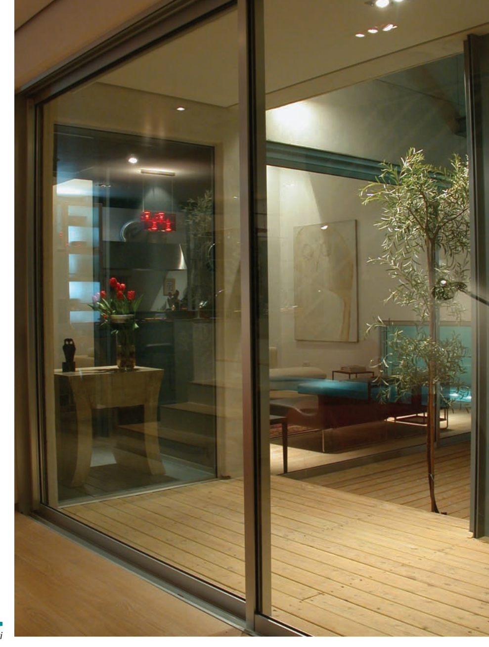
Private Residence 8 , Kansas City, Missouri