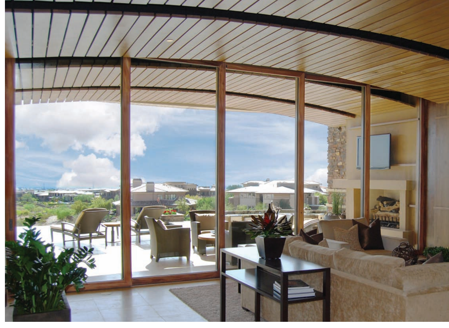
Private Residence 2, The "Ridges" Development, Las Vegas, Nevada

The secondary living space is doubled in size when the door panels all stack to either side, opening up the room to the patio. The opening is 30' wide by 12' high.