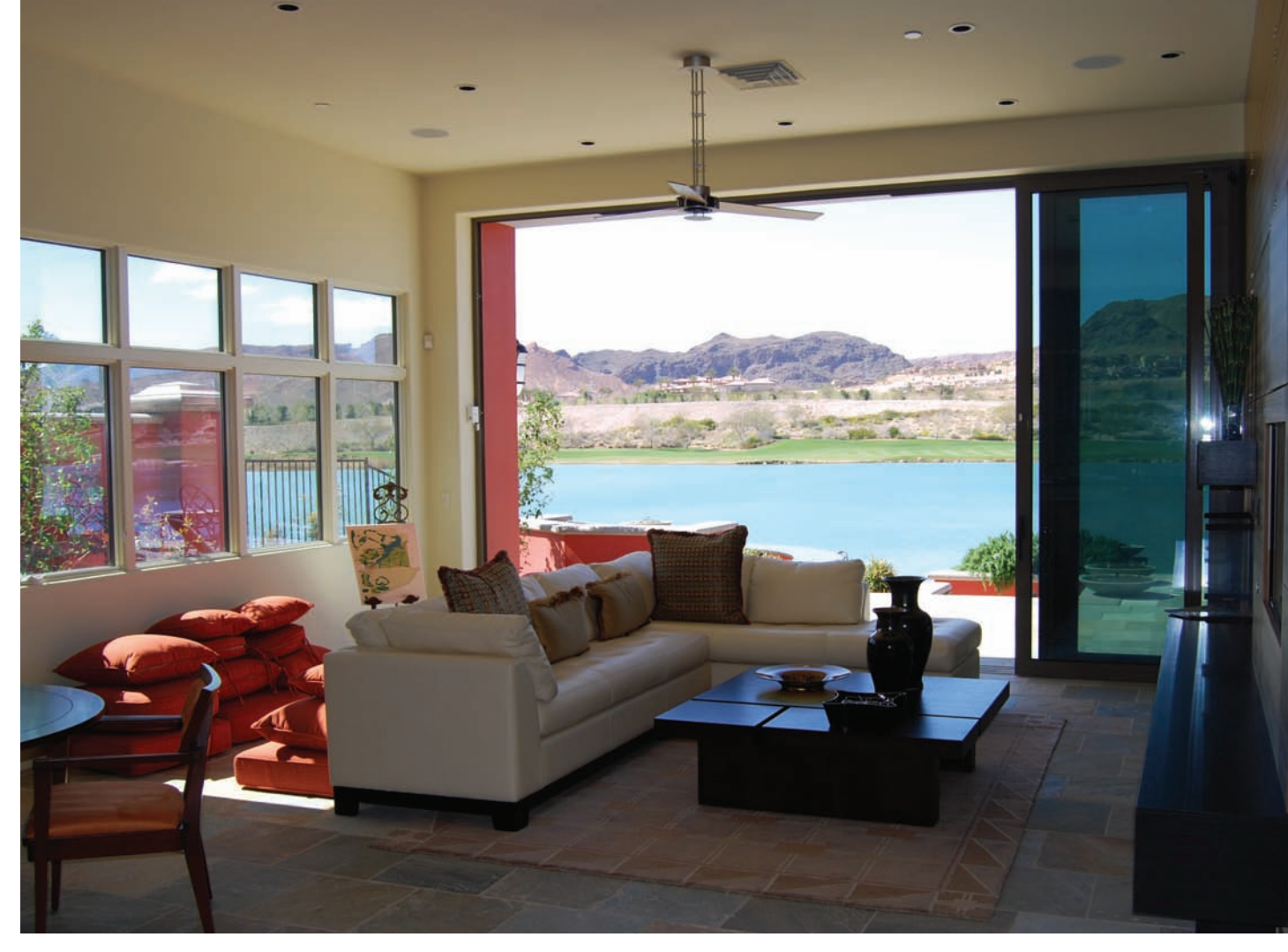
Private Residence 1, Lake Las Vegas, Henderson, Nevada

The 22' wide by 11' high door system opens up this living space to the lake shore and views of the Spring Mountains.