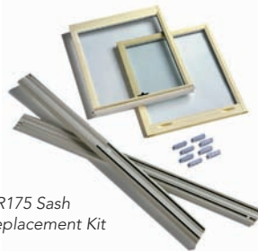
HR175 Sash Replacement Kit

HR175 historic renovation windows can be installed in one of two ways, providing the perfect installation method that best fits the budget of your residential or light commercial project.